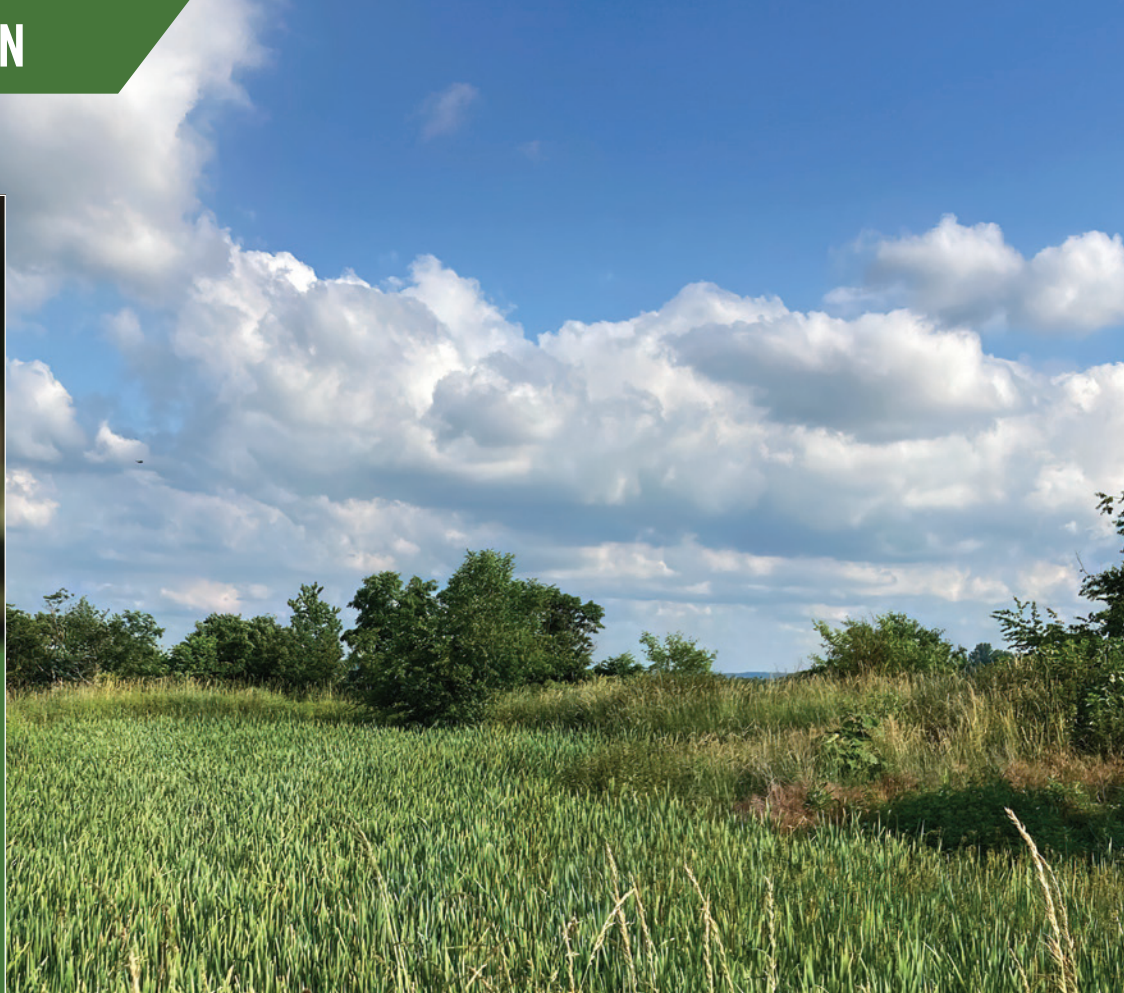
ALT's recently-conserved Reserve & Shaler project.