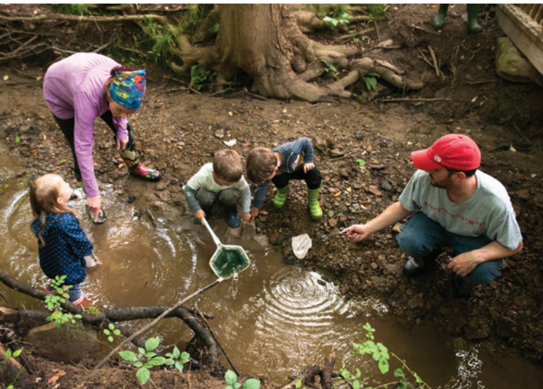
A family enjoys a creek running through Venango Trail.