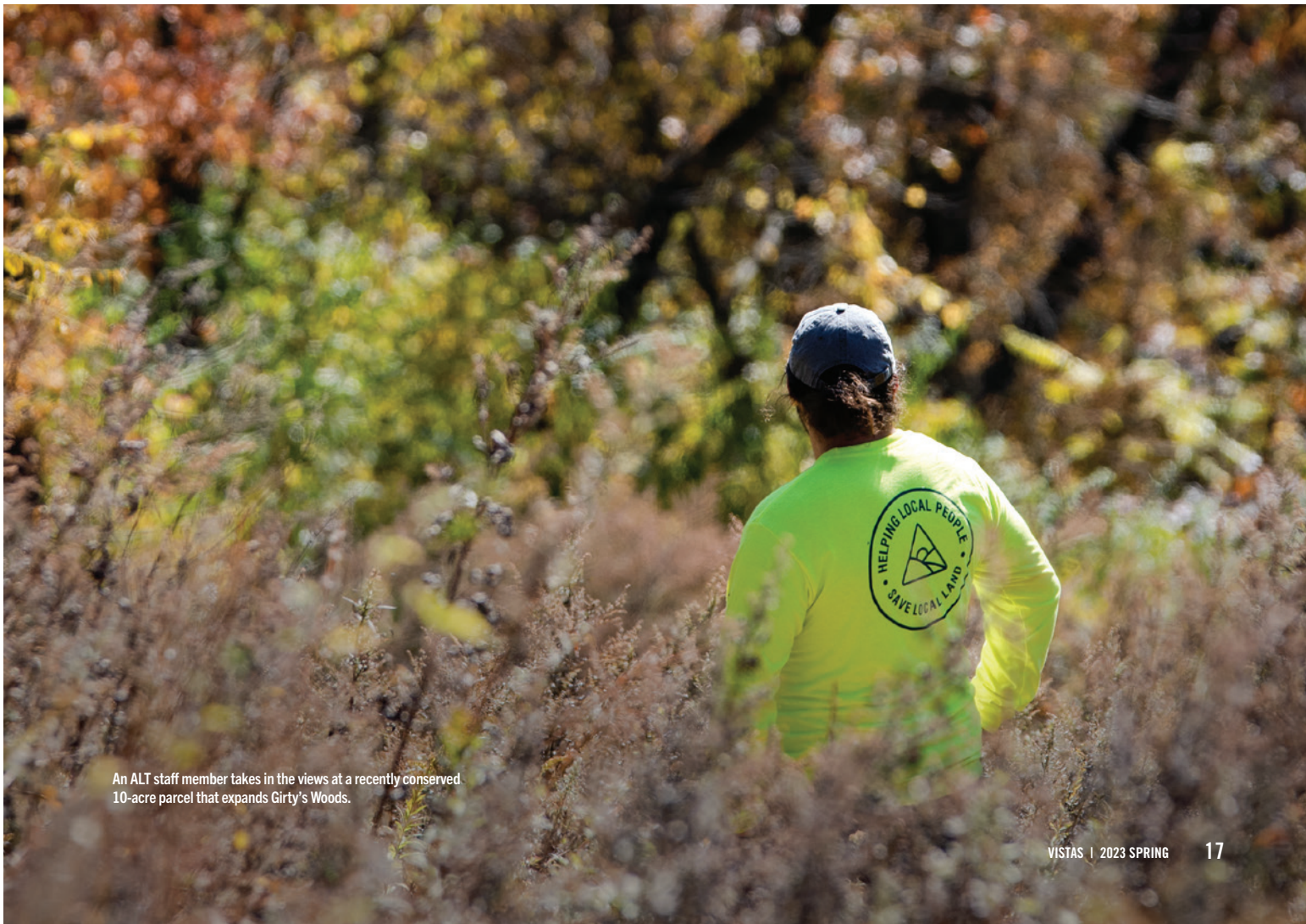
An ALT staff member takes in the views at a recently conserved 10-acre parcel that expands Girty's Woods.

ALT is proud to now conserve these lands, and already has three major conservation projects under contract this year. To learn more, visit: alleghenylandtrust.org/current-projects .