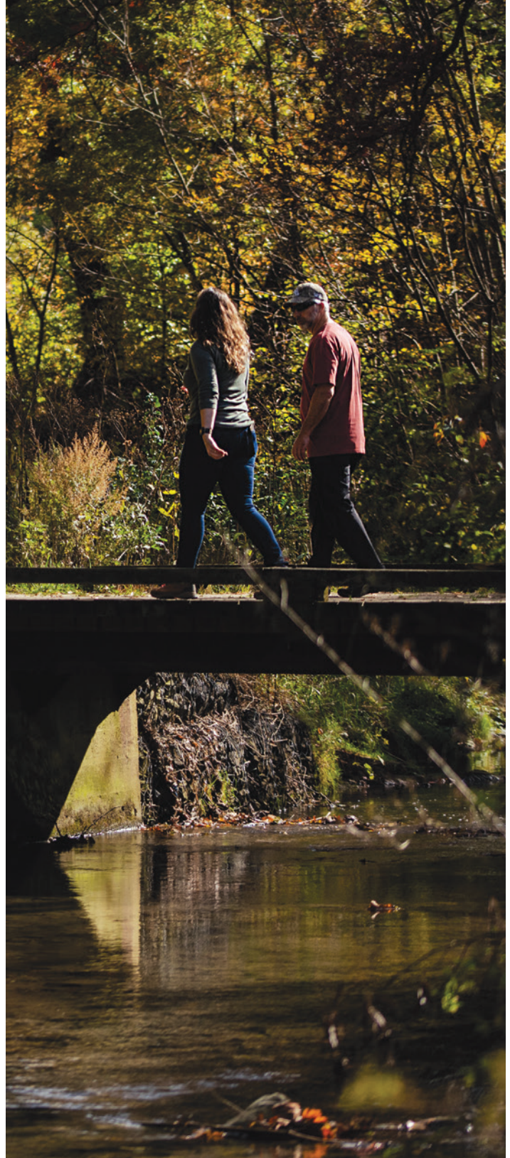
ALT team members cross a bridge at Churchill Valley Greenway.

Please note the giving suggestions are not intended to be financial planning, legal, or tax advice. Please consult your planner, lawyer, or accountant to determine if these forms of giving would be appropriate for your circumstances.