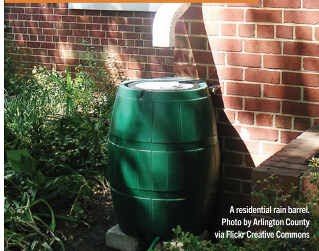
A residential rain barrel.