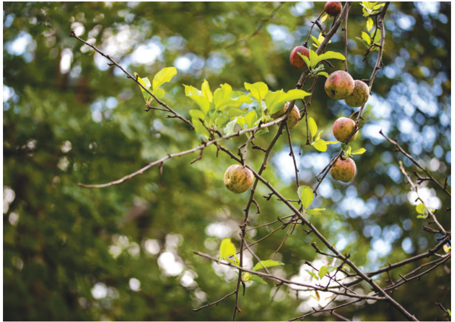
Apples grow at a recently protected ALT community conservation project.

Soon after was the closing of the Reserve-Shaler project, a partnership that resulted in a young farmer acquiring farmland while ALT protected the critical upland habitat. The success of these projects would not have been possible without the continued support from Shaler Area High School and the community as a whole. We are grateful for these opportunities to work with the community to conserve more green space!