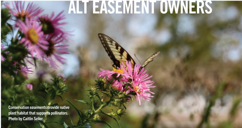
Conservation easements provide native plant habitat that supports pollinators.