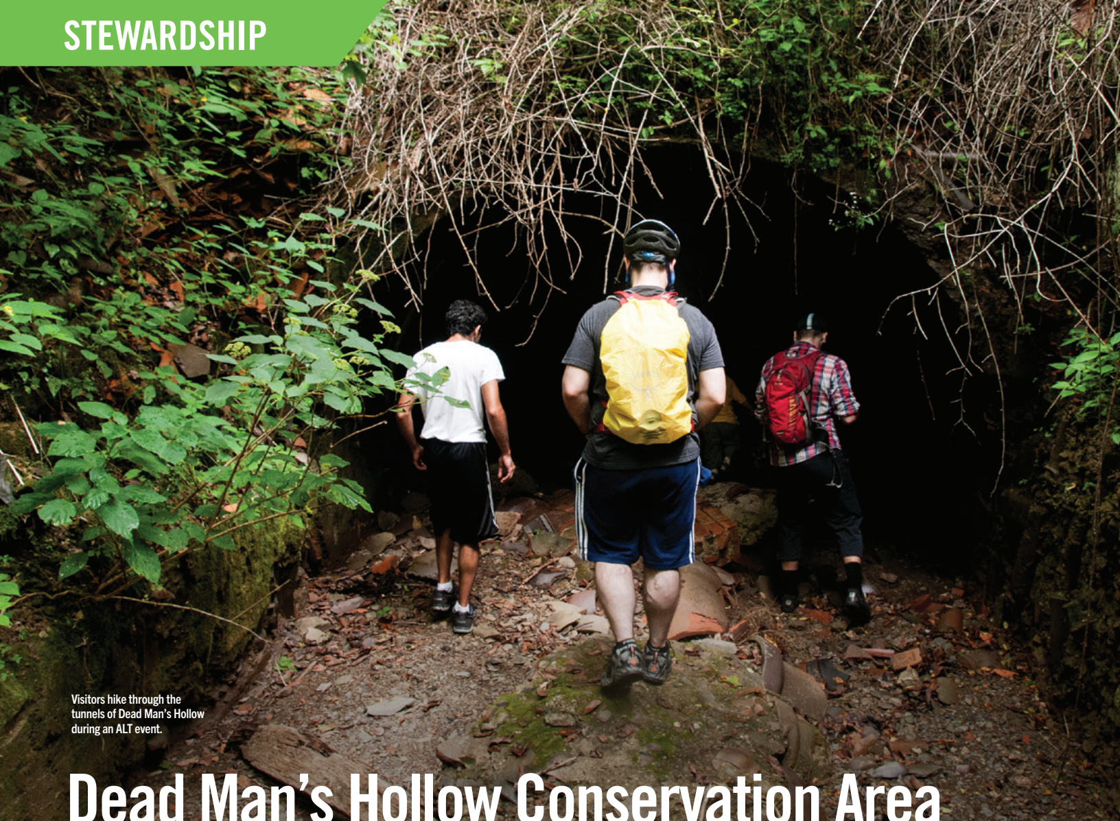
Visitors hike through the tunnels of Dead Man's Hollow during an ALT event.