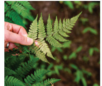
An educator displays the underside of a fern at Devil's Hollow