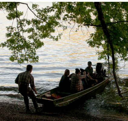
A group arrives at Sycamore Island's shore. Friends Of Sycamore Island communicate via Basecamp to organize volunteer outings and casual hikes with fellow island explorers.

What are the things you value most in your life? Maybe you think of your family, your friends, your job, your hobbies, and perhaps you start to think of your surroundings: the people, the places. And when do our “places” become communities?