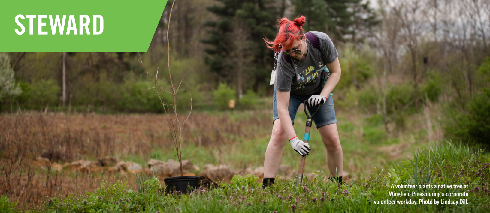
A volunteer plants a native tree at Wingfield Pines during a corporate volunteer workday.