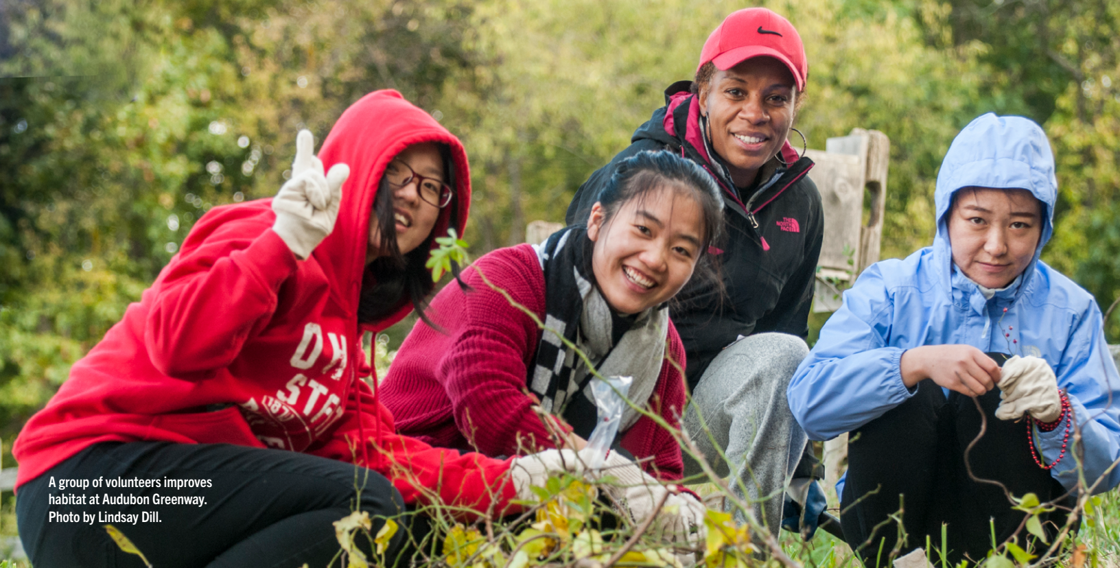
A group of volunteers improves habitat at Audubon Greenway.