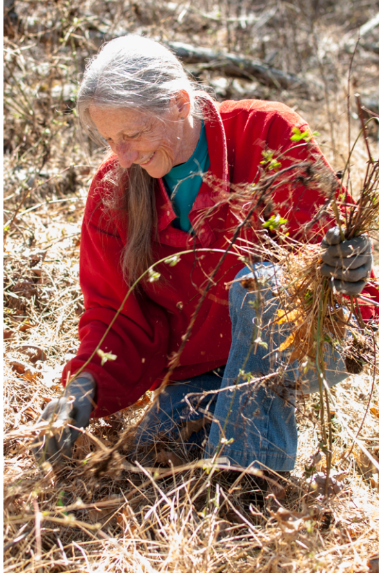
(left) A volunteer manages an area of Linbrook Woodlands Conservation Area. The fresh removal of invasive species makes way for native species that support wildlife food sources and habitat. (below) A robin bathes in a puddle at Barking Slopes. For our staff, the first robins of spring are a great sign to be thankful for.

5) LeafSnap | What's that tree you pass on your daily evening walk? Snap a photo of the leaf to start getting acquainted with your local tree species.