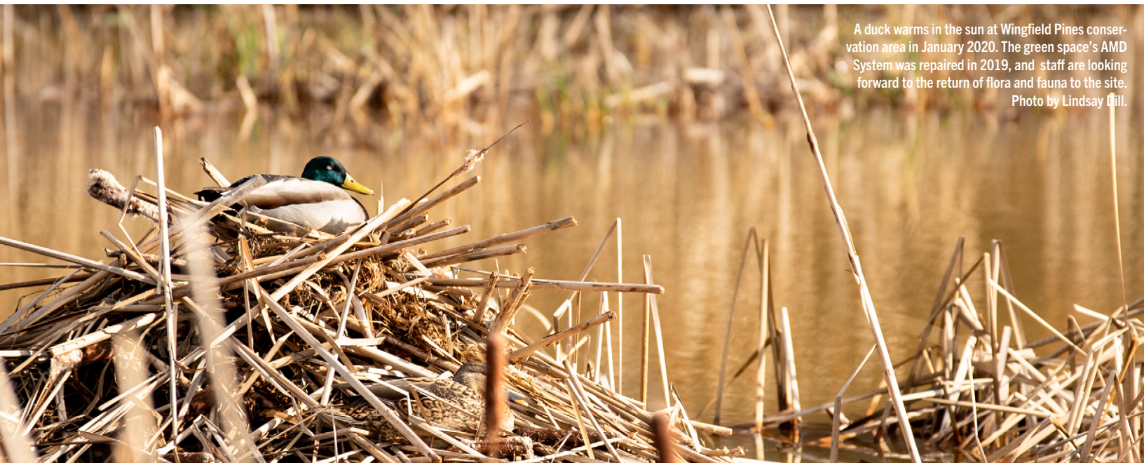
A duck warms in the sun at Wingfield Pines conservation area in January 2020. The green space's AMD System was repaired in 2019, and staff are looking forward to the return of flora and fauna to the site.