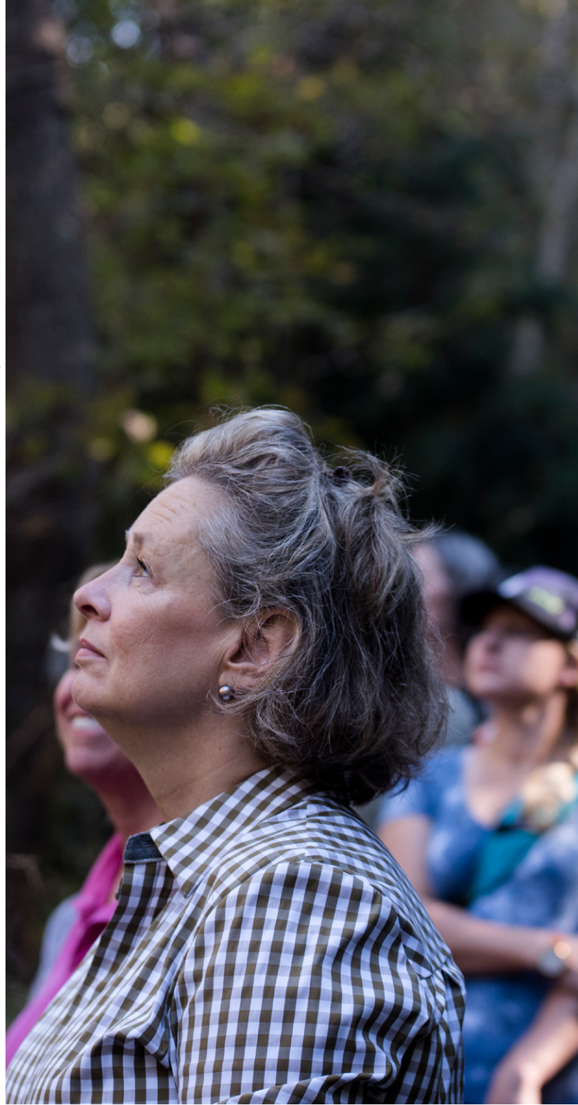
A visitor of Dead Man's Hollow Conservation Area takes in the scenery of the green space.

Please note that the above suggestions are not intended to be financial planning, legal, or tax advice. Please consult your planner, lawyer, or accountant to determine if these forms of giving would be appropriate for your circumstances.