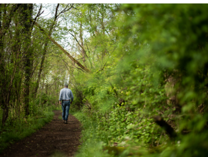
A hiker hits the trails of the now-protected Bethel Green Conservation Area. Protected at the end of March, this 40.5-acre conservation project received strong support on the individual and municipal levels, thus creating a permanent community green space in an urban landscape.

Every column in this series has discussed how our work as a land trust helps in addressing regional issues. From landslides to air quality, we've written about external environmental factors that affect every aspect of our lives; and in this issue of Vistas we're focusing on how an external factor like land can improve our internal personal lives and connections with others' personal lives.