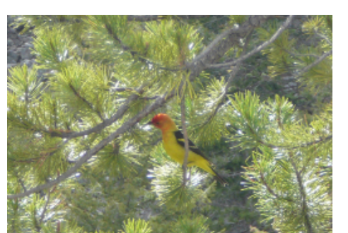
Twitter in the Trees Wingfield Pines

May 12 \mid 8 - 10 \text{ am}, 10 \text{ am} - 4 \text{ pm}