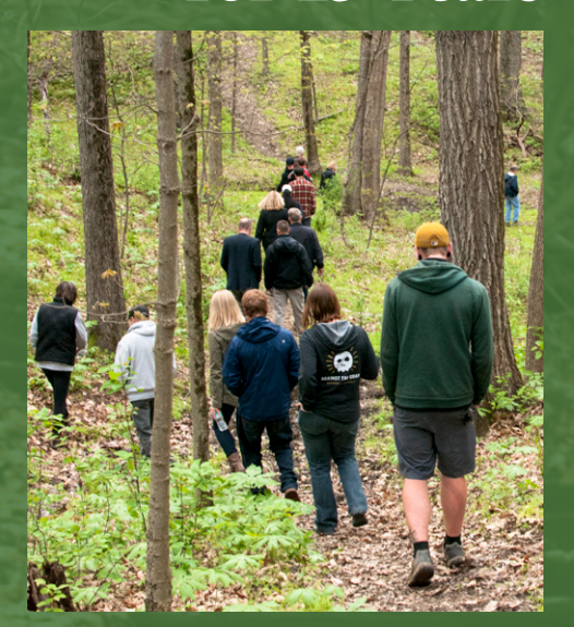
Volunteers, donors, and board members hike Linbrook Woodlands.