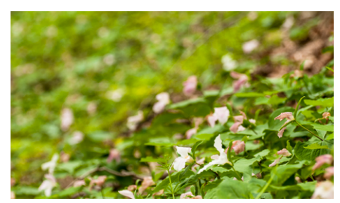
Plant Pursuit: Wildflowers Dead Man's Hollow