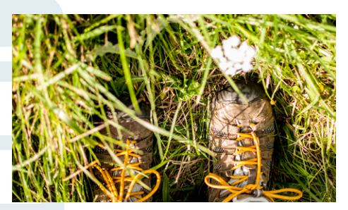
Fitness in the Trees (F.I.T.) Series, Basic Dead Man's Hollow

May - September, 1st & 3rd Wednesdays 1st Weds, 5 – 6 pm | 3rd Weds, 5 – 6:30 pm