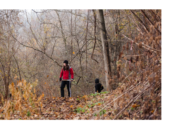
(Top) Volunteers improve trail at Barking Slopes Conservation Area.

(Right) ALT educators participate in a bird training at Wingfield Pines Conservation Area.